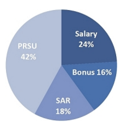
ALL OTHER NEOs